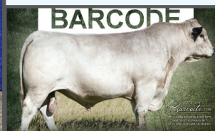
PATERNAL GRANDSIRE TO EMBRYOS: NOTTA 101Y BARCODE 113B

PRAIRIE HILL ENTICER 89G SPOTS 'N SPROUTS 6A P.A.R. LITTLE EDDIE II 93E PUSSY KAT II OF P.A.R. 11D