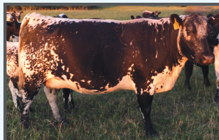
DAM: SPOTS 'N SPROUTS 10X