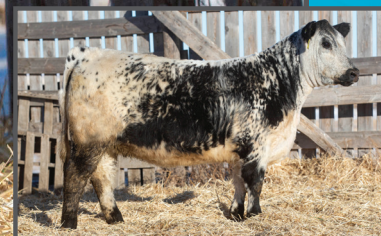
3/4 SISTER: WALDNER PRIDE 051H