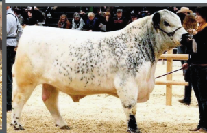
OUTBACK JOEY 25D

SPOTS 'N SPROUTS JUNO 103J STAR BANK 55H STAR BANK 64R RIO 6W STAR BANK TARAZED 46T