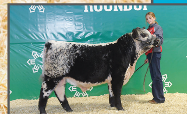
NOTTA 305E PRIME TIME 312H